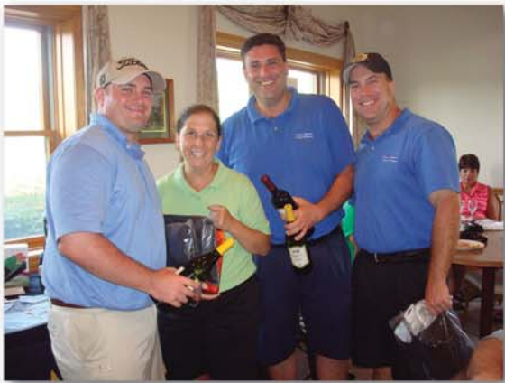
The 1 st Place Mixed Team at the 6 th annual Father Champlin's Guardian Angel Society golf tournament.

MONEY Federal Credit Union is proud to be an integral part of this event every year.